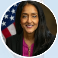
HONORABLE VANITA GUPTA ASSOCIATE ATTORNEY GENERAL DEPARTMENT OF JUSTICE