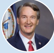
THE HONORABLE GOVERNOR OF VIRGINIA, GLENN YOUNGKIN