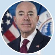
THE HONORABLE ALEJANDRO MAYORKAS SECRETARY OF HOMELAND SECURITY